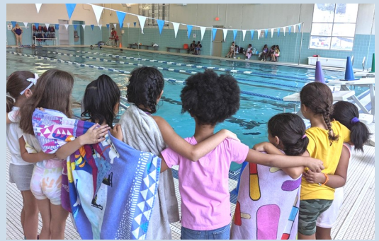
Children at Camp at South Amboy learn swimming and water safety skills.