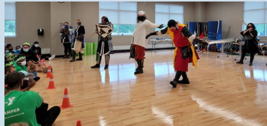
The Knights of Crossford visit Camp Lenape to educate the children about medieval times.