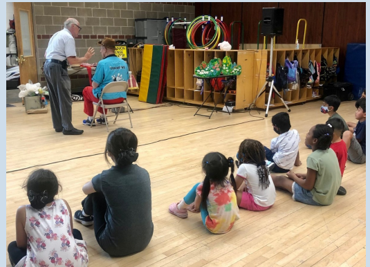
The Grand Falloons perform for the campers, making them laugh while learning!