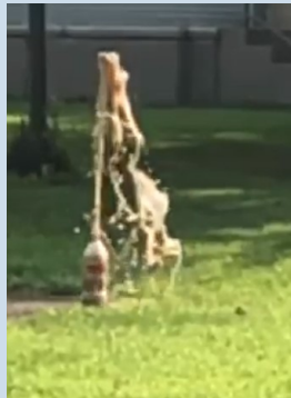
Campers enjoy the Mad Science at Enrichment Camp at Oakcrest, where they got to test out the famous Mentos and Coke experiment!