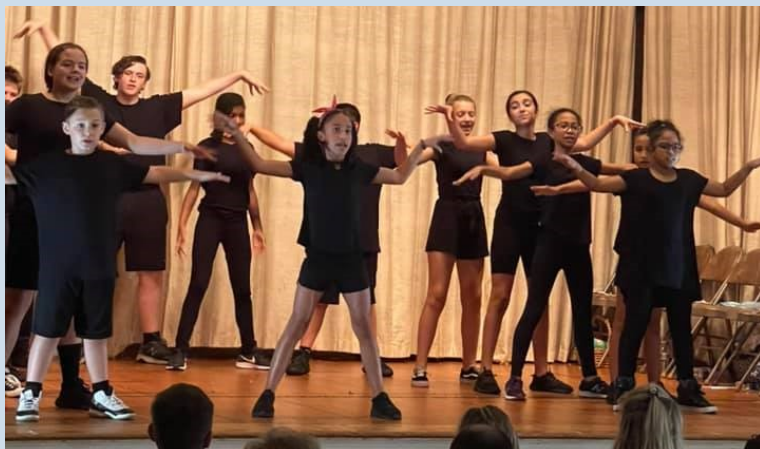
Camp Munsee's first time ever Theater Camp was a huge success! The campers put on an amazing show of "Broadway's Greatest Hits"!