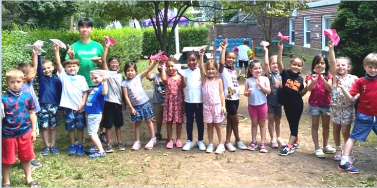
Camp Munsee campers blasted off to travel and explore the stars and planets!