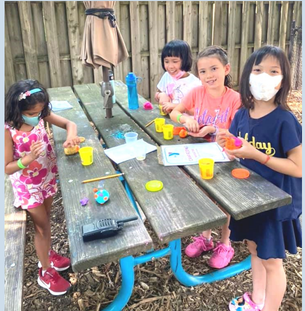
Campers at Camp Munsee explored magical, mystical creatures, made slime, searched for Big Foot, did magical experiments and more.