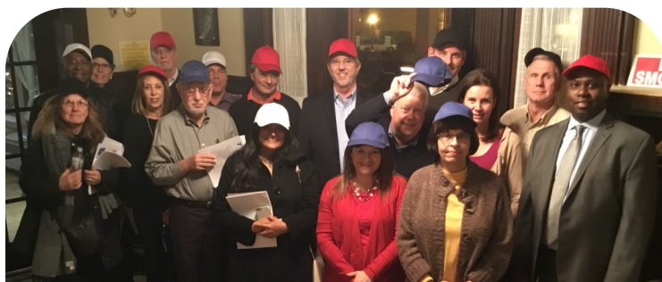
Board members wearing their "Team Caps"

We look forward to a very successful 2017-2018 Campaign!!