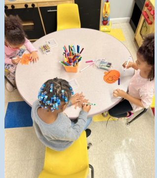
AVENEL EARLY LEARNING CENTER