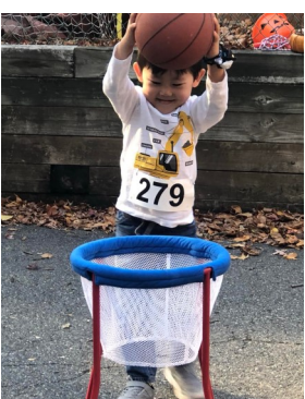
Centenary holds Turkey Trot Triathlon!