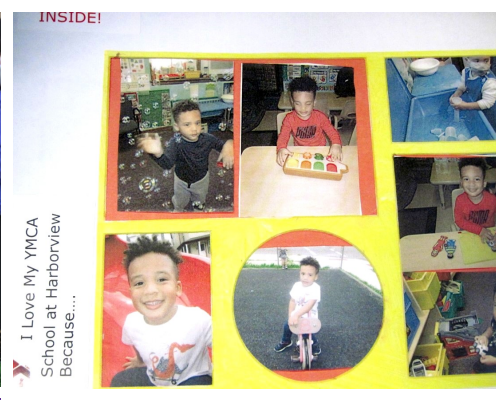
Harborview students write why they love the YMCA!