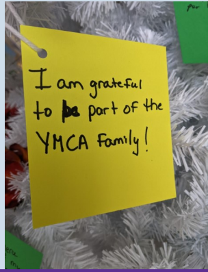
SOUTH AMBOY YMCA