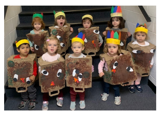
Centenary Early Learning Center's Pre-K students are ready for Thanksgiving!