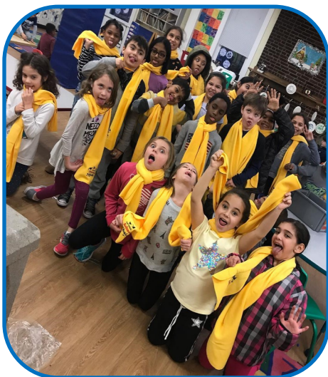
Metuchen preschoolers have fun with their National School Choice Week yellow scarves!