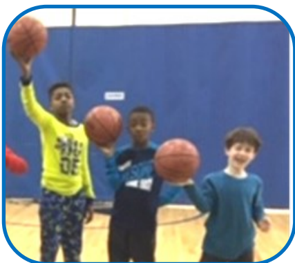
South Amboy youth play basketball with equipment that was donated by SNY Play Ball!