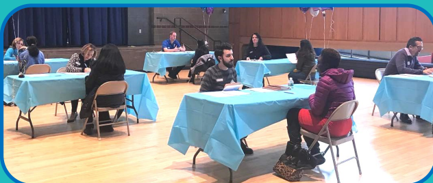
Edison staff interview eligible candidates.

FOR MORE INFORMATION, VISIT YMCAOFMEWSA.ORG/ EMPLOYMENT