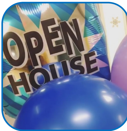
All of the branches held Open Houses on January 5th for membership and camp!