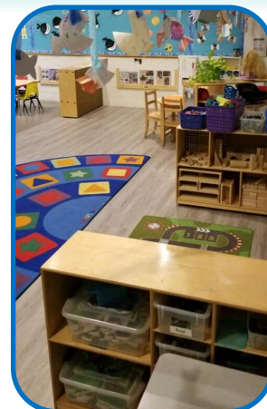
Edison Y Early Learning Center gets new flooring in Pre-K classroom!