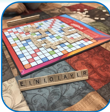
Metuchen offers new Adult Game Lounge!