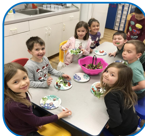
Metuchen's SACC children having a salad for their healthy snack!