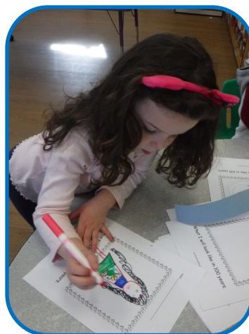
Students have fun with their 100 Days of School projects.