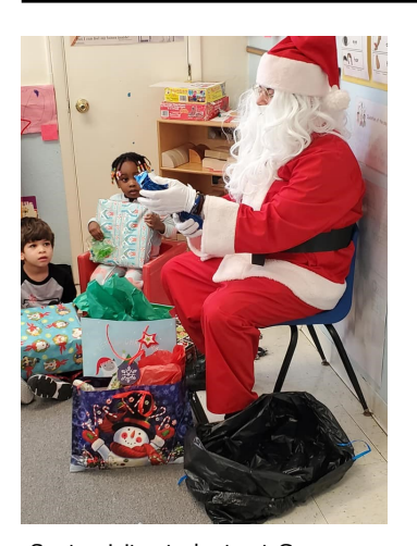
Santa visits students at Grace Early Learning Center