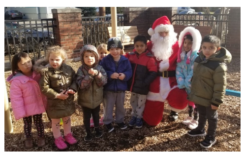
Santa (a Metuchen YMCA member) stops by to visit the Metuchen Preschoolers.