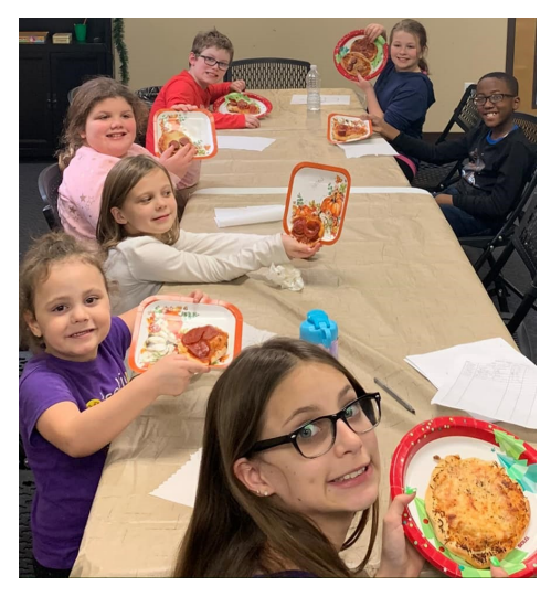
South Amboy kids enjoy holiday camp cooking!