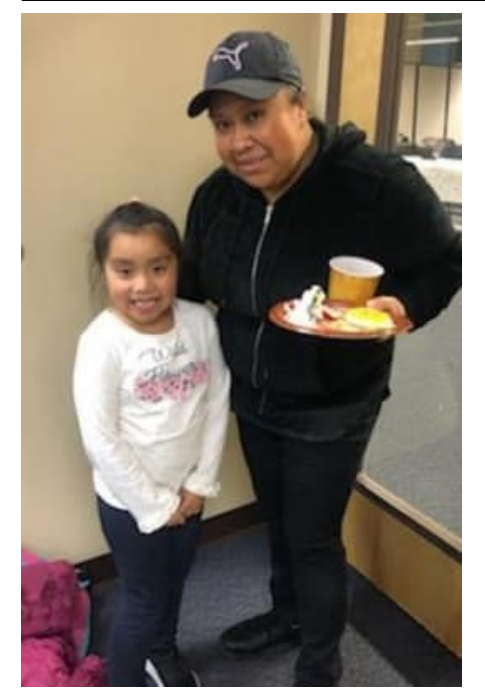
South Amboy hosts a potluck dinner during National Family Month.