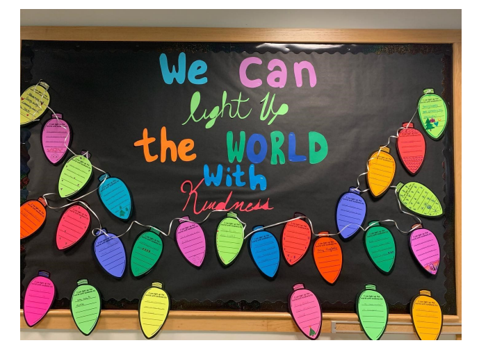
The Leader's Club lights up the world with kindness this holiday season.