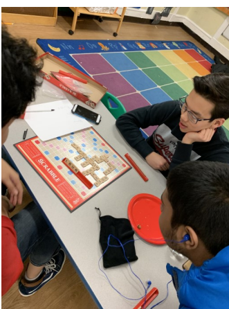
The Metuchen Leader's Club celebrates the holiday's with a fun game night!