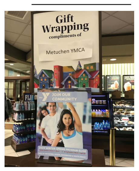
Metuchen staff and Y volunteers wrap gifts at Barnes & Noble to raise money towards the Annual Support Campaign.