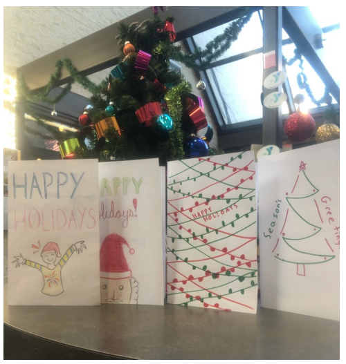
The Edison Leader's Club made holiday cards for the veterans at the Veteran's Home in Edison. The CEO and Supervisor of Recreation at the Veterans Home sent a letter thanking everyone for their generous donation!