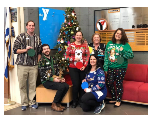
Edison staff get in the holiday spirit!