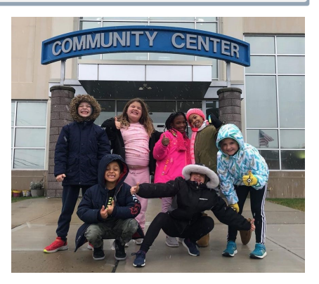
SAY's Afterschool Program had a great time at the Y on the first snow day of the season!