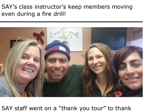
local community business owners for their support in 2019.