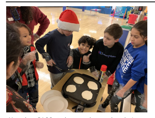
Metuchen SACC students cook pancakes during their STEM session!