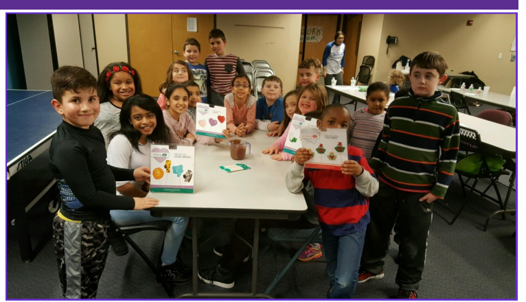
-Submitted by Beth Helsby

The South Amboy YMCA had another successful Kid's Night Out on February 10<sup>th</sup>. It was called Chocolateers Night to celebrate Valentine's Day. The 20 children enjoyed pizza and swimming. They also enjoyed finger painting with chocolate and made their own chocolate pops. Lots of laughs were heard while they watched Gnomeo & Juliet. Of course, the evening ended with a nice cup of hot chocolate!