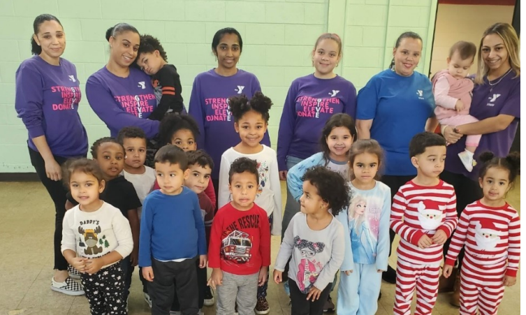
Grace Learning Center participates in PD Da