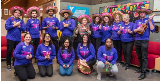
Edison YMCA has fun with their "Fiesta" theme