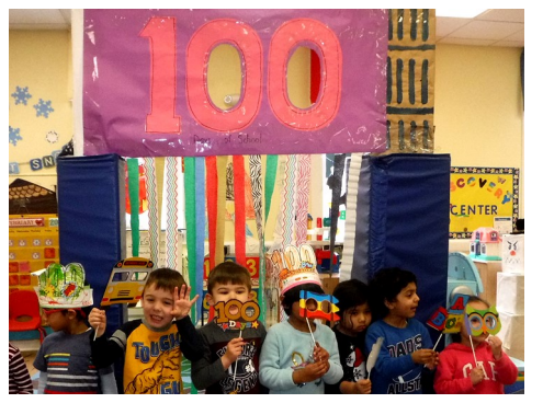
Metuchen Y Preschool children celebrate 100 days of school.