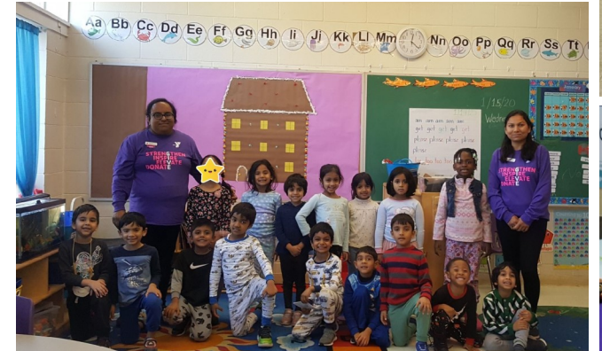
Our Saviors Learning Center holds "PJ Day