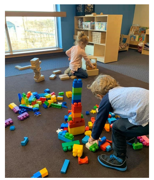
New Build It! classes have begun engaging younger participants at the South Amboy branch.