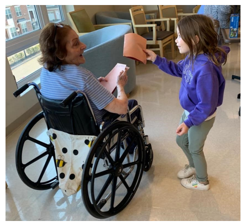
South Amboy Holiday Camp and SACC participants spread some Valentine's Day love by bringing handmade cards to the residents at the Venetian Rehabilitation Center!