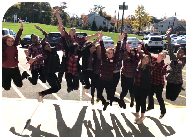
Enthusiastic Metuchen staff decided to dress alike for the event

This training is a great way for the staff to share stories, plan new activities and bond over all things SACC!