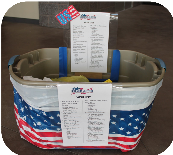
A collection basket for goods was in the lobby, with a Wish List for particular items needed. The goods were sent to Operation Gratitude, who makes care packages that they send directly to our troops.