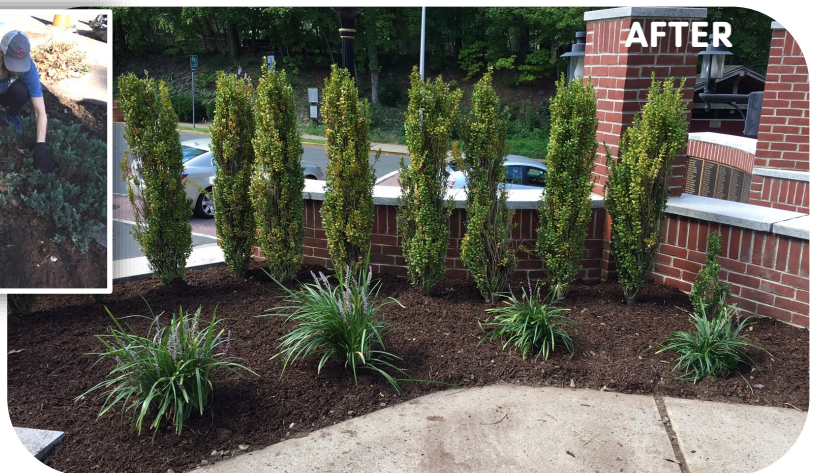
The "After" pictures. The area has been beautified, with plants, bushes and flowers adorning the area by the highly visible Freedom Plaza.