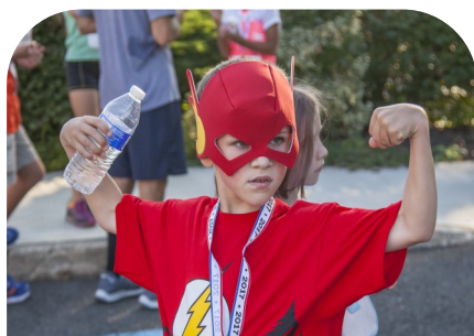
"CALLING ALL SUPERHEROES"

The theme this year was "Calling All Superheroes" and many participants came out in full garb for a very colorful race. Race results can be found here and a full list of our sponsors can be found on the YMCA website here .