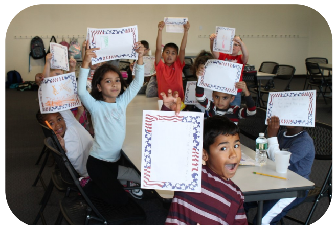
The SACC children drew pictures and wrote thank you notes.