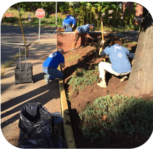
Volunteers work hard to remove all of the old debris and weeds that congest this area and make it unsightly.

Volunteers from the Metuchen Y, along with the Metuchen Garden Club, Fire Department and Public Works beautified the area by Freedom Plaza on September 8th to prepare for the 9/11 anniversary. Also of note is that Ed Van Eckhart of Farmers Insurance donated $500 for their t-shirts and supplies. What a great show of support from the Y and the community to make this area beautiful again!