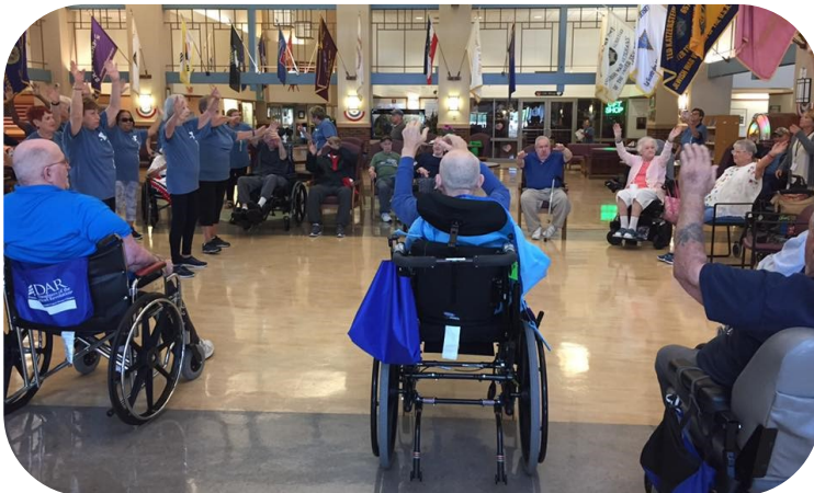
YMCA staff hold an Enhance Fitness class with the veterans in their "Town Square"