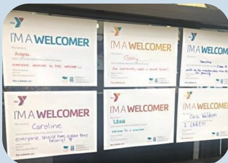
Edison members share what they love about the Y!