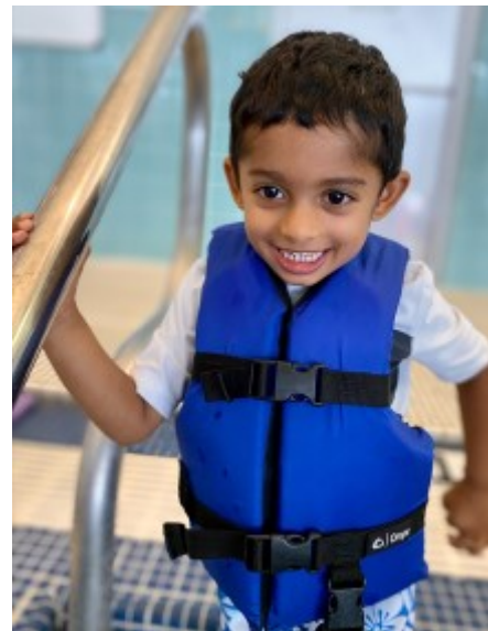
South Amboy's SACC at the South Amboy Elementary School made their first of many weekly bus trips to the South Amboy for a Swim & Gym!