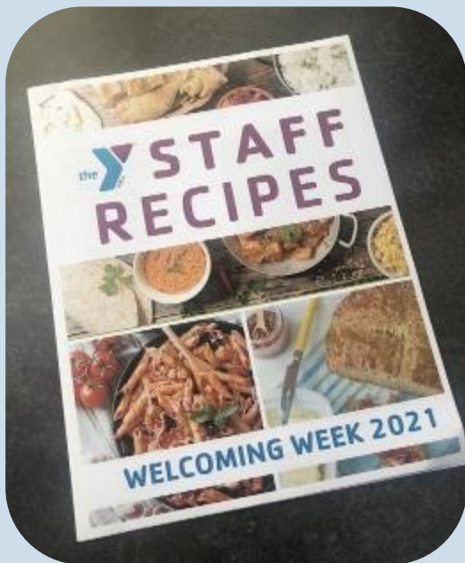
Edison YMCA staff contributed recipes from their own family's cultures that members could take home with them!