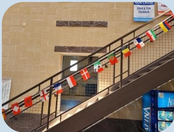
South Amboy decorates the branch with flags around the world to represent the different cultures of their members.