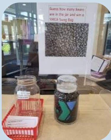
South Amboy members guess how many beans are in the jar to win a swag bag!