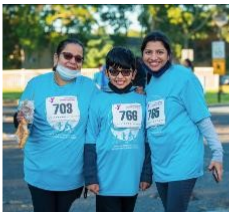
Having fun at the 5K!