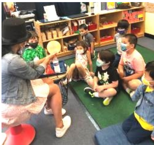
Kindergarteners at Centenary settle into the new school year.