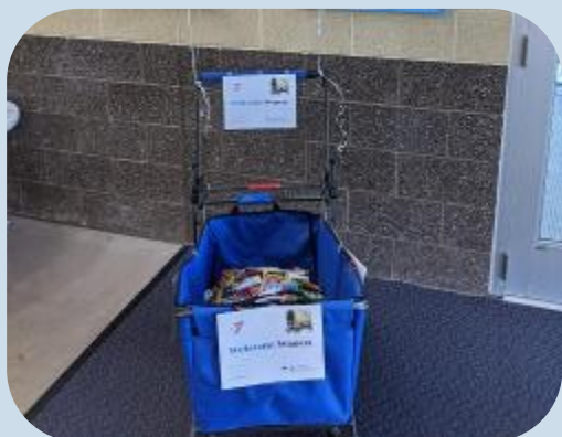
South Amboy provides healthy snacks for it's members.