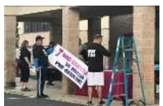
Staff begin arriving at 6:00 a.m. to set up