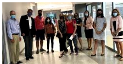
Board members meet for the first time in person since March 2020!