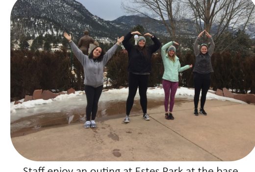
Staff enjoy an outing at Estes Park at the base of Rocky Mountain National Park.

society for the better. Staff noted that it was very inspiring to be surrounded by YMCA family from all around the country and are returning with many new ideas that they are excited to get off the ground!